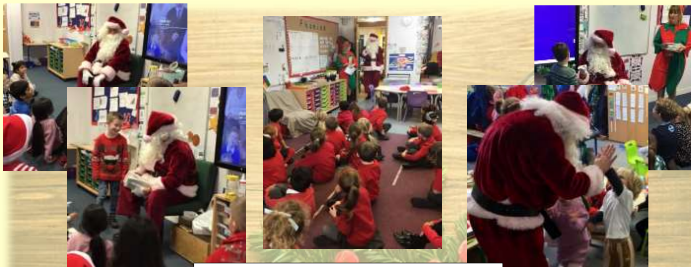
Our very special visitor this week

This week at Yorke Mead! Bringing Learning to Life